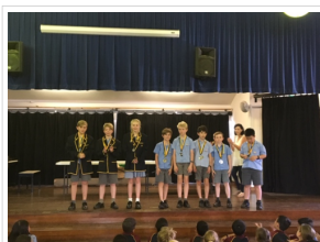
EOY Kindergarten Lunchtime 2018