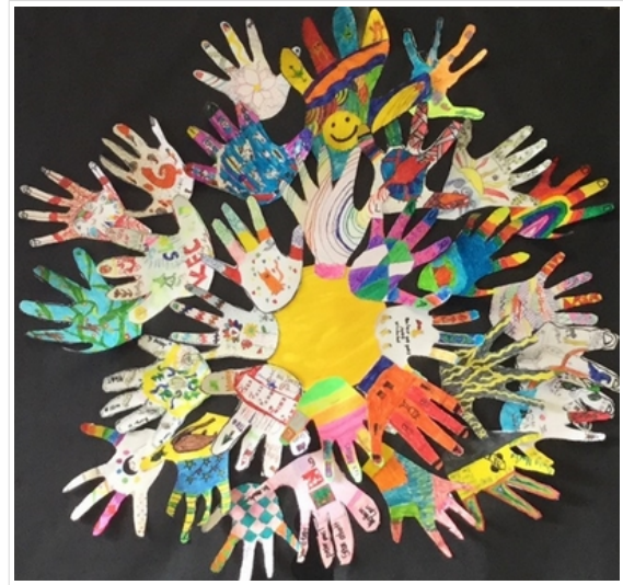
Hands - Every Individual Counts