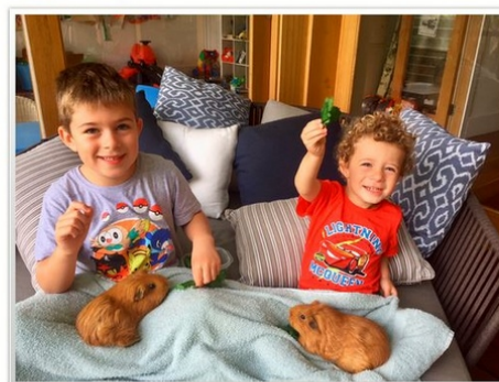
Guinea Pig Carers

If you would like to care for them over a weekend please complete the form and return to the front office.